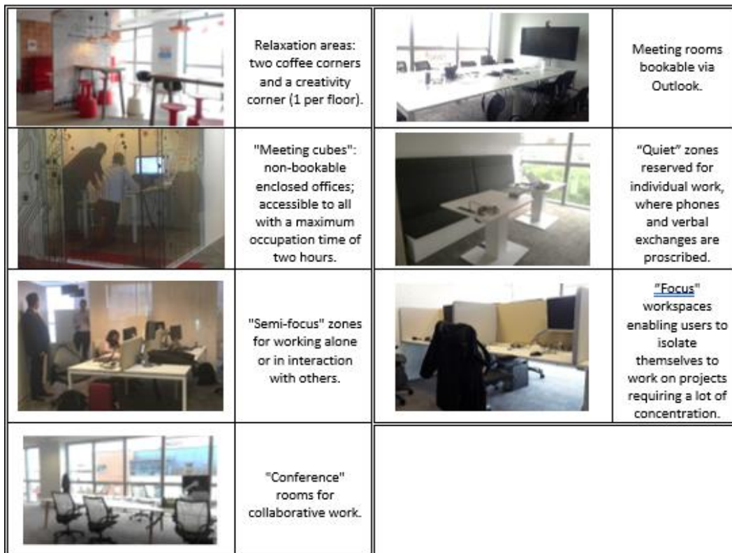
Figure 1: Presentation of the different types of workspaces and workstations