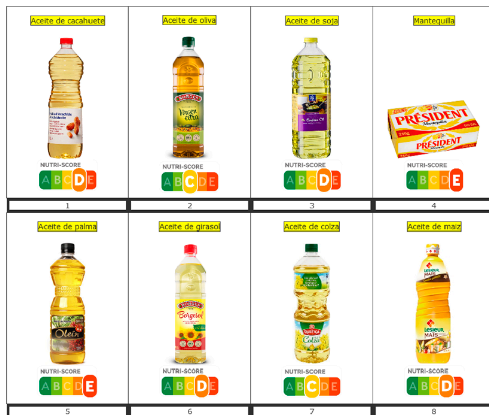
Figure 1. Pictures of the different vegetable oils and butter tested with their corresponding Nutri-Score from C to E.

perception and understanding of Nutri-Score. The present study focuses specifically on the questions related to perceptions of added fat. Pictures of seven vegetable oils and butter, with their corresponding Nutri-Score, were presented to participants (Figure 1).