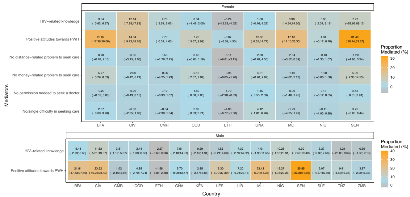
Fig. 3. Heatmap of the proportion mediated by each mediator in the total effect of wealth on HIV testing, stratified by sex (eligible models). Refer to Table 1 for full country names. PWH, people with HIV.

Liberia and Niger among women (Table S4, Supplemental Digital Content, http://links.lww.com/QAD/C570 ). The paths from each mediator to HIV testing uptake were also explored (Figure S2 and Table S5, Supplemental Digital Content, http://links.lww.com/QAD/C570 ). In all eligible countries except Lesotho, all mediators were positively associated with recent testing (Table S5, Supplemental Digital Content, http://links.lww.com/QAD/C570 ).