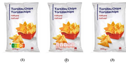
Figure 1 An example of a food product in the Nutri-Score (1), Reference Intakes (2) and no label (3) arms. Images developed by the coauthors.

For this specific purpose, an experimental online supermarket was developed, similar to previous trials. 18 28