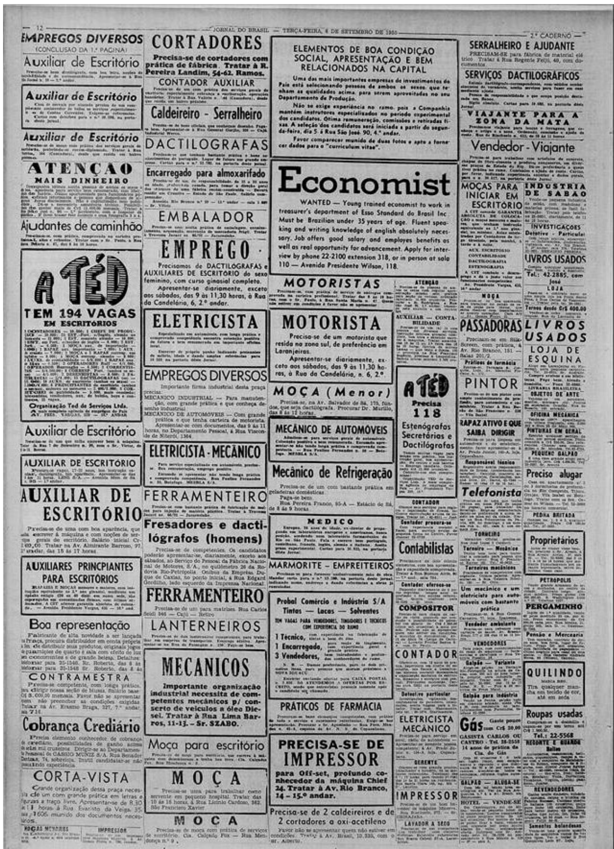
Source: JB, 6/09/1955, 2º cad., p 12.