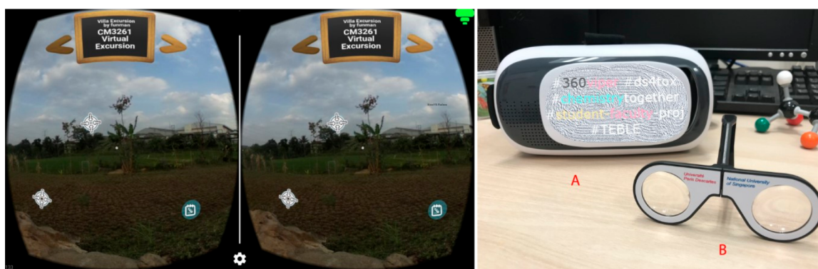
Figure 2. (Left) View of the Binoo using the VR mode. The split screen shows two pictures for each eye. By doing so it creates an immersive environment. (Right) VR gear: goggle (A) and lenses (B).