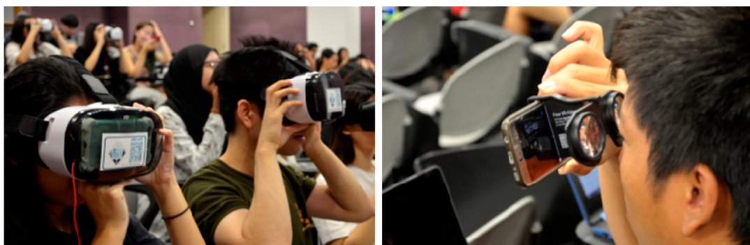
Figure 3. Students viewing the virtual field trip via the VR goggle (left) and lenses (right).

In our pilot project, edu2VR assisted teaching by providing students with access to photospheres of a rural region, Ungaran, in Indonesia. The instructor uploaded these photospheres prelecture. During lecture, the instructors guided students via their own panopticon in a field trip study. Afterward, students had to answer questions regarding the environment.