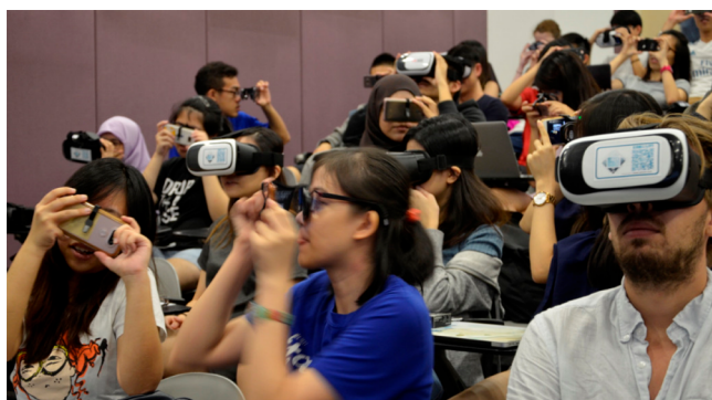
Figure 4. Students immersed in the virtual field trip at their own pace.

at NUS. On a Likert scale of 1–5, students rated their virtual field trip experience (Table 1).