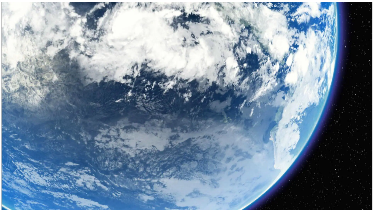
Ozone Hole , Jamie Lockhead, 2018

A new (sub-)genre has emerged in the field of documentary films since the mid-2000s namely the eco-documentary. The makers of these films generally present their approach as both an analysis of political responses to environmental problems and an attempt to raise citizens' awareness to incite them to take action. To achieve this dual purpose, they combine "a rhetoric of facts and documented reality" with "narrative and visual strategies that add emotion and identification to the viewer experience". [1] However, some of the narrative and image-based choices are problematic for me as a historian. Above all, I question both the effectiveness of current eco-documentaries in inciting people to take action and the nature of change they encourage.