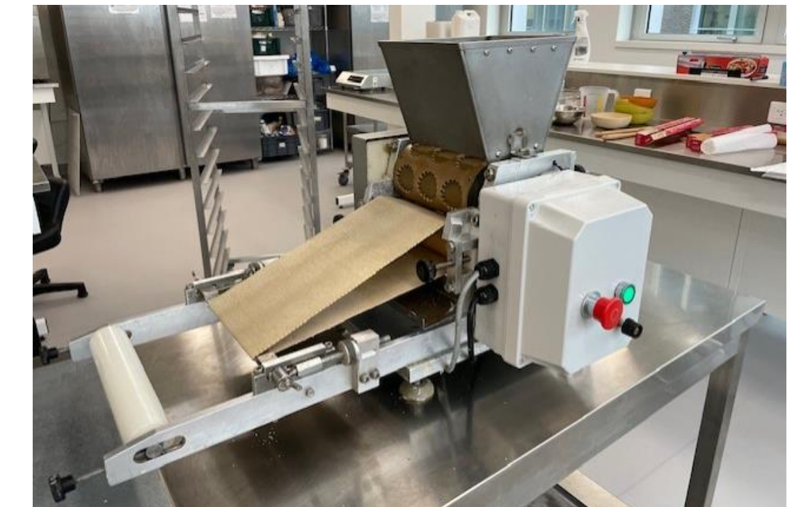
Laboratory rotary molder (AgroParisTech Campus, Palaiseau)