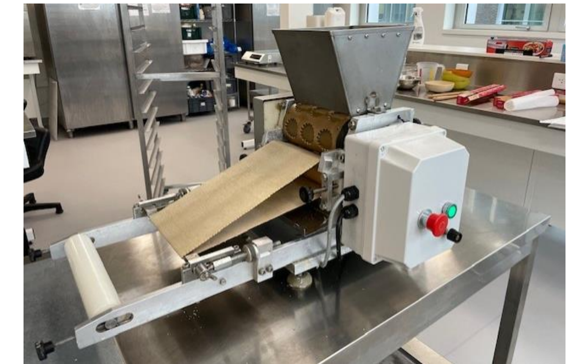
Laboratory rotary molder (AgroParisTech Campus, Palaiseau)