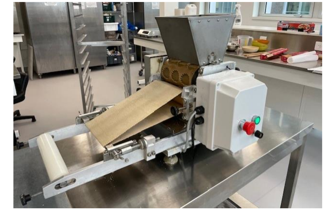
Laboratory rotary molder (AgroParisTech Campus, Palaiseau)